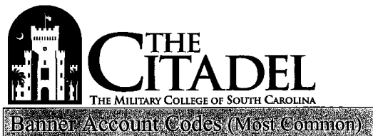
EXHIBIT "J" BANNER ACCOUNT CODES